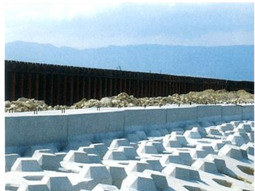
Kobe offshore disposal site (Steel sheet pile)