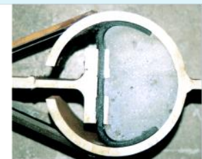
< Steel sheet pile >