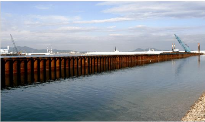
Tokushima prefecture Awazu Port sea surface disposal site (Steel pipe sheet pile)

In Japan : Kobe offing disposal ground, Awazu, Tokushima Port disposal ground Hibikinada Port, Mizushima Port and others