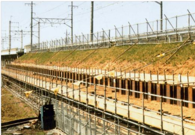
Example of embankment railway