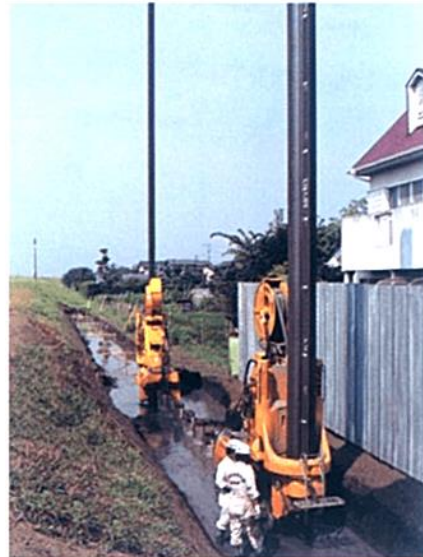
Example of press-in pile driving

In Japan : many records rubble mound at railroad : Musashino Line, Tokaido Shinkansen (Nagoya) rubble mound at river : Tone River, Yodo River, Shinano River, Sira River, Midori River etc.